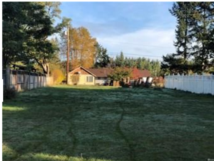
1 / 4